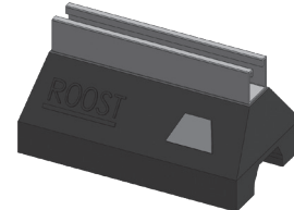
FIG. 7510RT7100Z Rooftop Support Block 10" STRUT CHANNEL: Pre-Galv, 1-5/8" X 1-5/8"