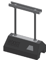
FIG. 7510RTE7200Z1200 Rooftop Support Block 10" STRUT CHANNEL: Pre-Galv, 13/16" X 1-5/8" adjustable 6" - 12"