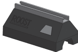
FIG. 7510RT7200Z Rooftop Support Block 10" STRUT CHANNEL: Pre-Galv, 13/16" X 1-5/8"