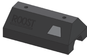
FIG. 7510RT Rooftop Support Block 10" STRUT CHANNEL: N/A