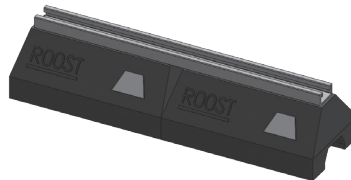
FIG. 7520RT7200Z Rooftop Support Block 20" STRUT CHANNEL: Pre-Galv, 13/16" X 1-5/8"